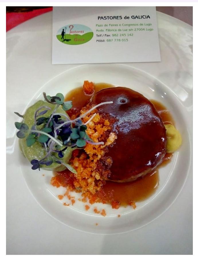
Lamb dish made with Pastores de Galicia product. Association of sheep and goats breeders of Galicia.

Farmers in extensive collaborate in the care and protection of nature.