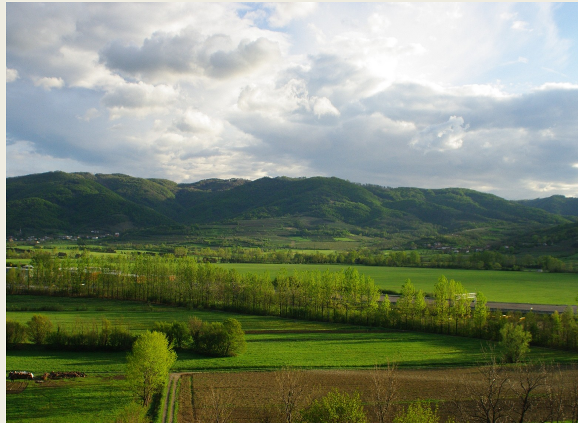
Picture 2: Trees belts in arable landscape - natural and planned alley belts in Vipava valley incorporated in RBS and SA practice.