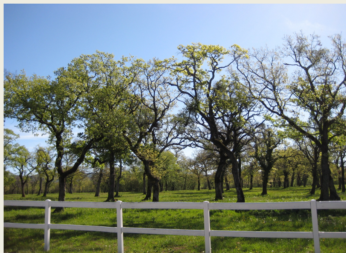
Picture 5: Silvopasture - Picture from Lipica cradle of white Lipizzaner horses where silvopasture is being in practice from 1580.