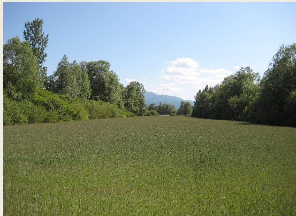
Picture 3: Hedgerow in Ljubljansko barje - a multi purpose and multi-functional landscape element.