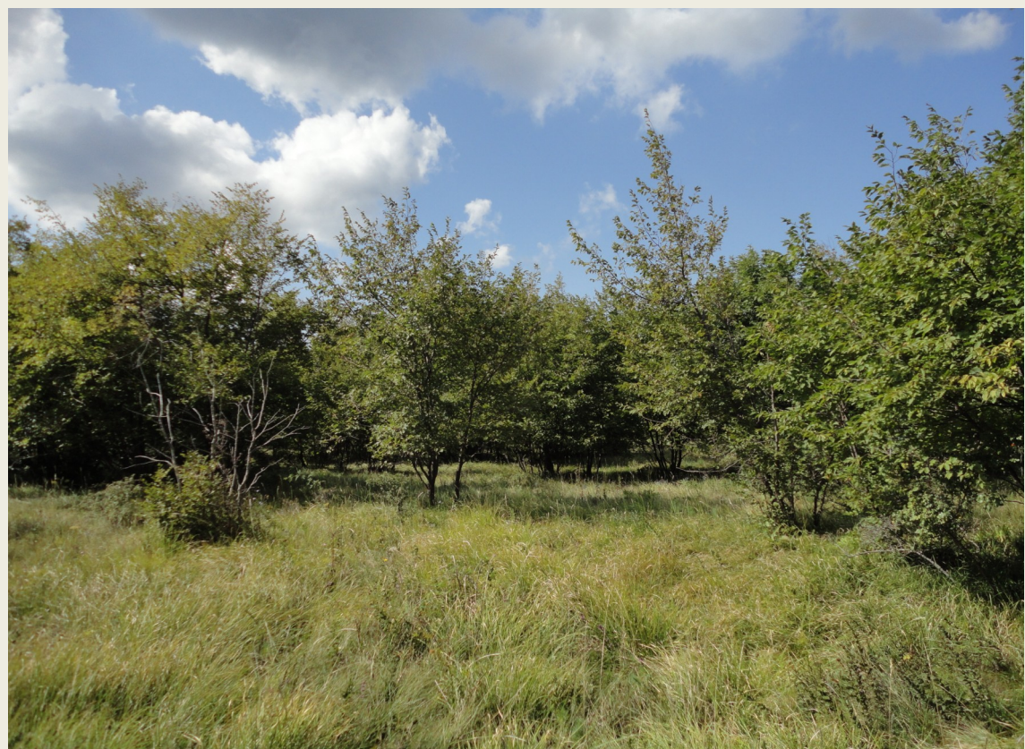
Picture 1: Multipurpose forests in Slovenia - forest where production of cultivated crops is promoted. Natural truffle site can contribute to higher income land.