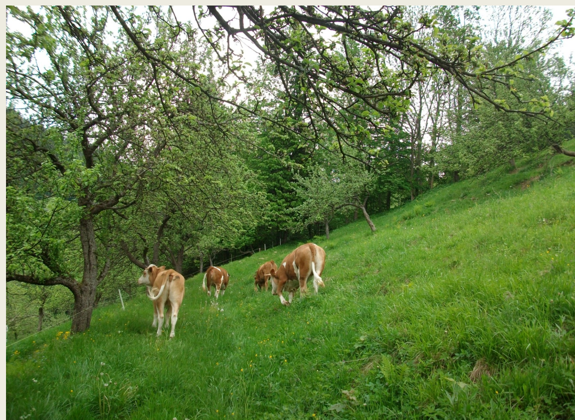
Picture 4: Pasture and orchards - multi purpose trees provide farmers a multiple benefits.