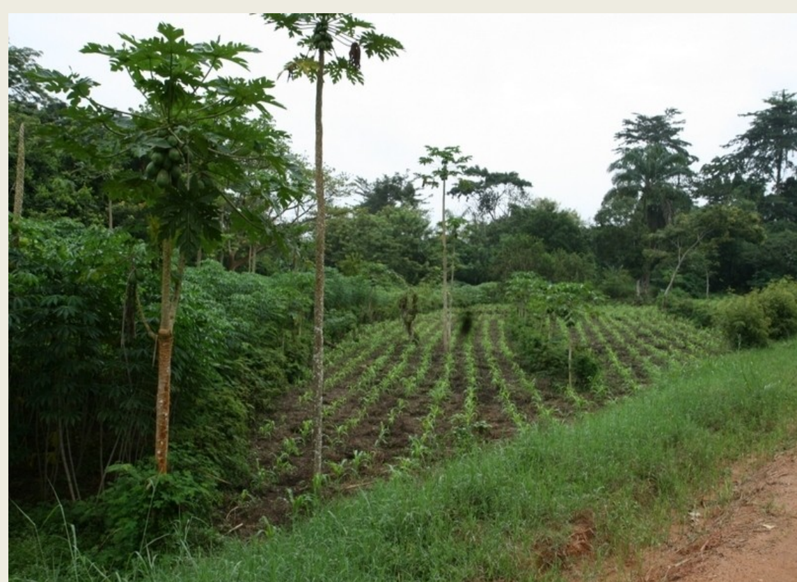
Picture 6: Improved fallow - Perhaps a future use type also in Slovenia, but not interesting at this moment.