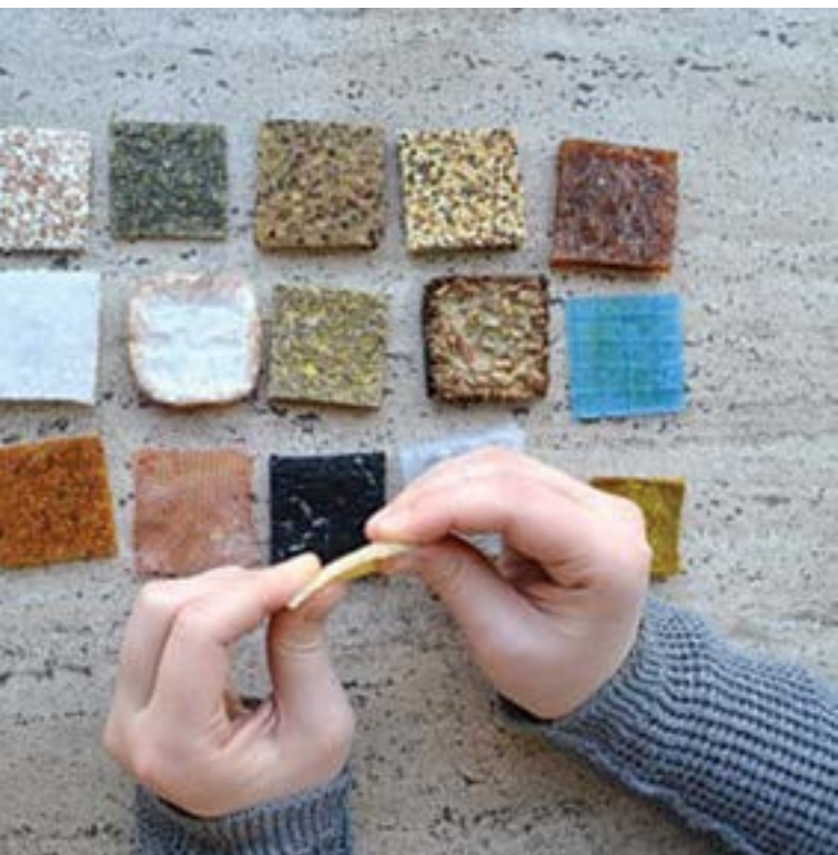
Bio-residues from the olive processing can be used also to produce bio-materials Cecilia Cecchini