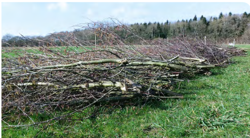
Coppiced alder drying in field before chipping.

Other advantages include, improvements to soil organic matter, support for farmland biodiversity, and the substitution of fossil fuel with renewable energy.