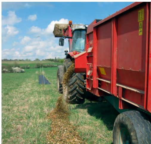
Applying woodchip for weed control Ref: Jo Smith, ORC

Agroforestry has the potential to help to meet these conflicting demands by integrating energy production from short rotation coppice and livestock production, without compromising the environment.