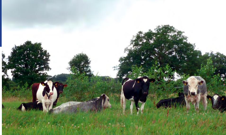
Cattle and short rotation coppice.