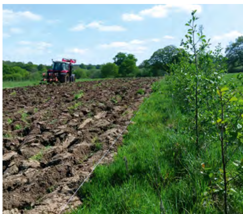
Cultivating the alleys.