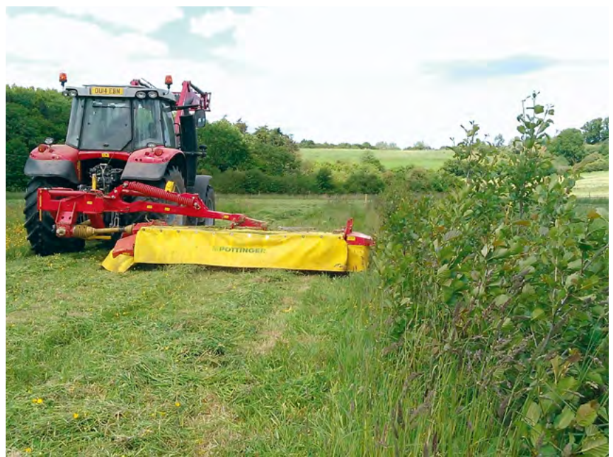
Cutting for silage Ref: Jo Smith, ORC

Common alder ( Alnus glutinosa ) was also planted as it coppices well and it fixes nitrogen, which may be useful for organic systems. However, its value as a fodder crop was unknown. Trials comparing different weed control approaches found that woodchip mulch can perform as well as fabric mulches. Further, as it can be sourced on-farm or from local tree surgeons for free, it provides a good approach to weed control in organic systems. Tree establishment rates were initially low due to dry spring weather in the first two years, and there was a high level of replanting, particularly of the willow. Trees were cut to a height of 10 cm after one year to encourage multiple branching and a silage cut was taken from the alleys once or twice a year for the first four years, with cattle first introduced in the fifth year. In the sixth year, the pasture was ploughed in and oats grown for whole-crop silage before re-seeding with a diverse pasture mix.